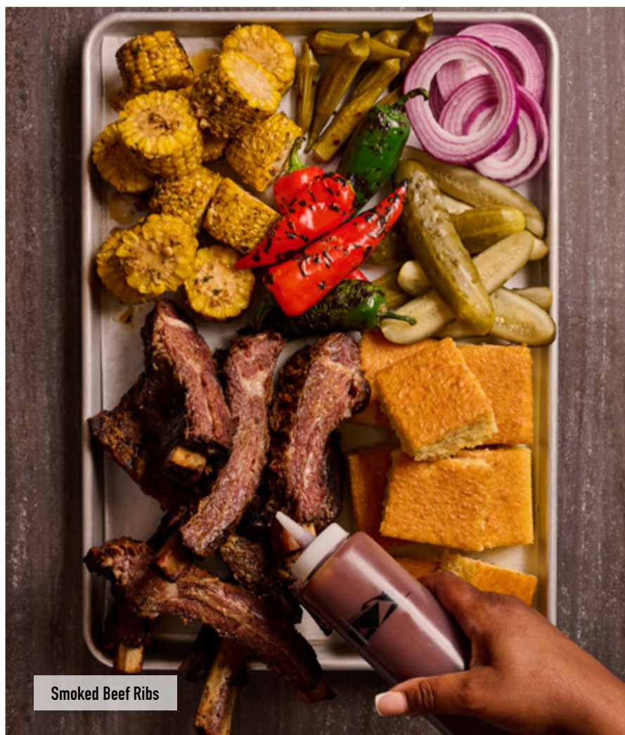
Smoked Beef Ribs

+These items will arrive to your suite by kickoff