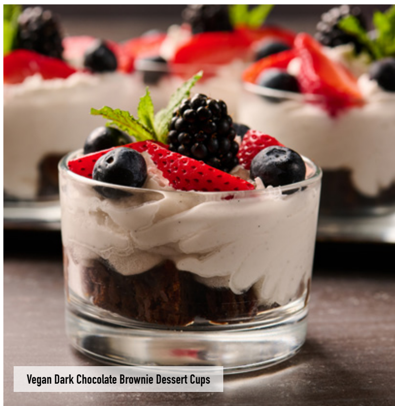
Vegan Dark Chocolate Brownie Dessert Cups

*These items will arrive to your suite by kickoff