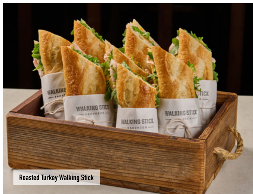
Roasted Turkey Walking Stick

+These items will arrive to your suite by kickoff