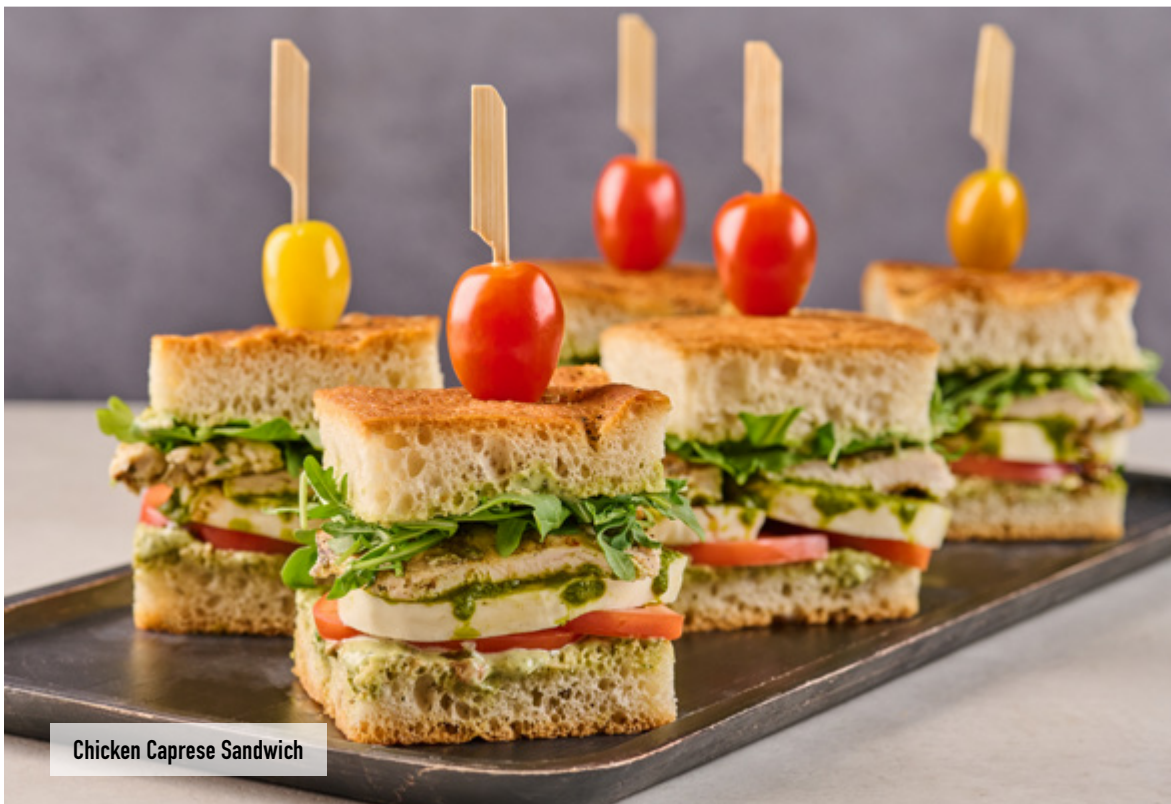
Chicken Caprese Sandwich

Turkey, Ham, Cheddar, Swiss, Lettuce, Tomatoes, Red Onions, Louie Dressing, Two Foot Twisted Wheat Baguette