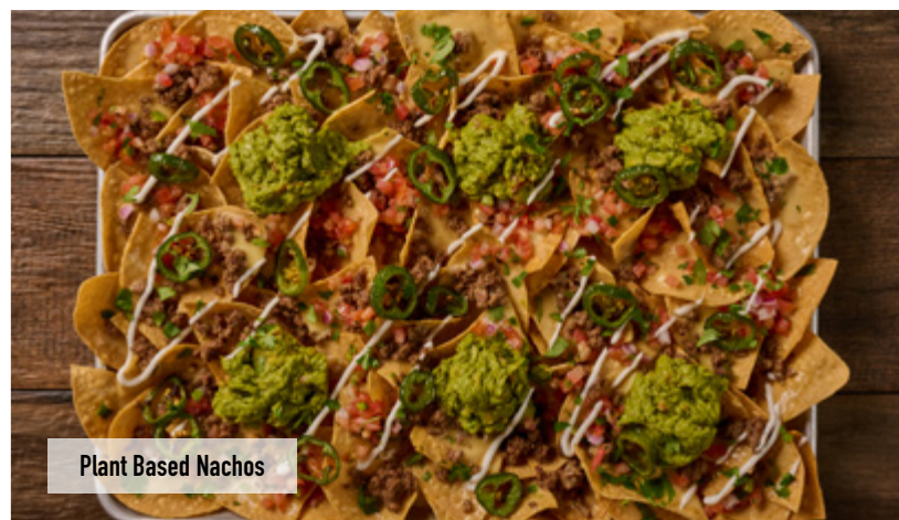
Plant Based Nachos

+These items will arrive to your suite by kickoff