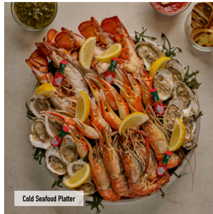
Cold Seafood Platter

*Consuming raw or undercooked meats, poultry, seafood, shellfish, or eggs may increase your risk of foodborne illness, especially if you have certain medical conditions.