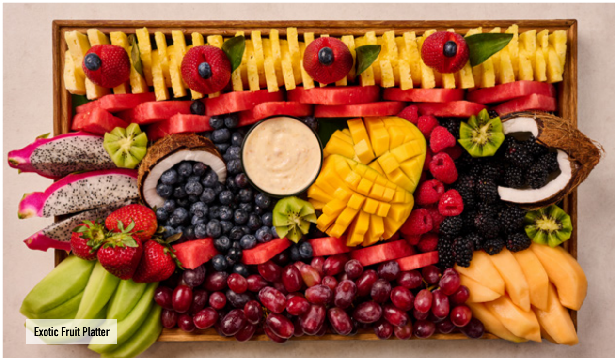
Exotic Fruit Platter