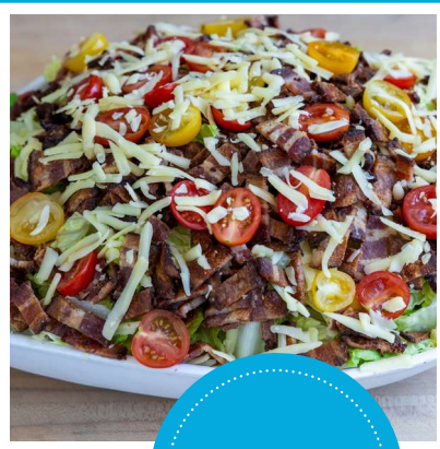
LOCAL BLT SALAD

Yakisoba Noodles, Edamame, Bell Peppers, Cabbage, Carrots, Broccoli, Cilantro, Miso Sesame Dressing