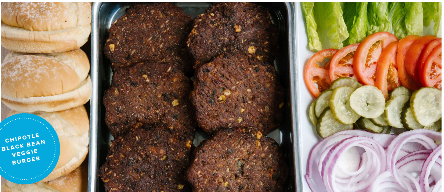
CHIPOTLE BLACK BEAN VEGGIE BURGER

We are proud to provide an avoiding gluten menu for our guests and have taken tremendous strides to identify all forms of gluten and gluten derivatives in the foods we purchase or prepare in-house. However, we cannot be responsible for individual reactions, or guarantee that there has been no cross-contamination. Our guests are encouraged to consider the information provided in light of their individual needs and requirements.