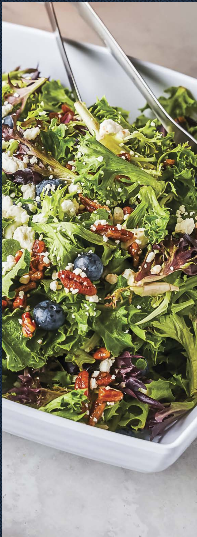
Berry Pecan Salad