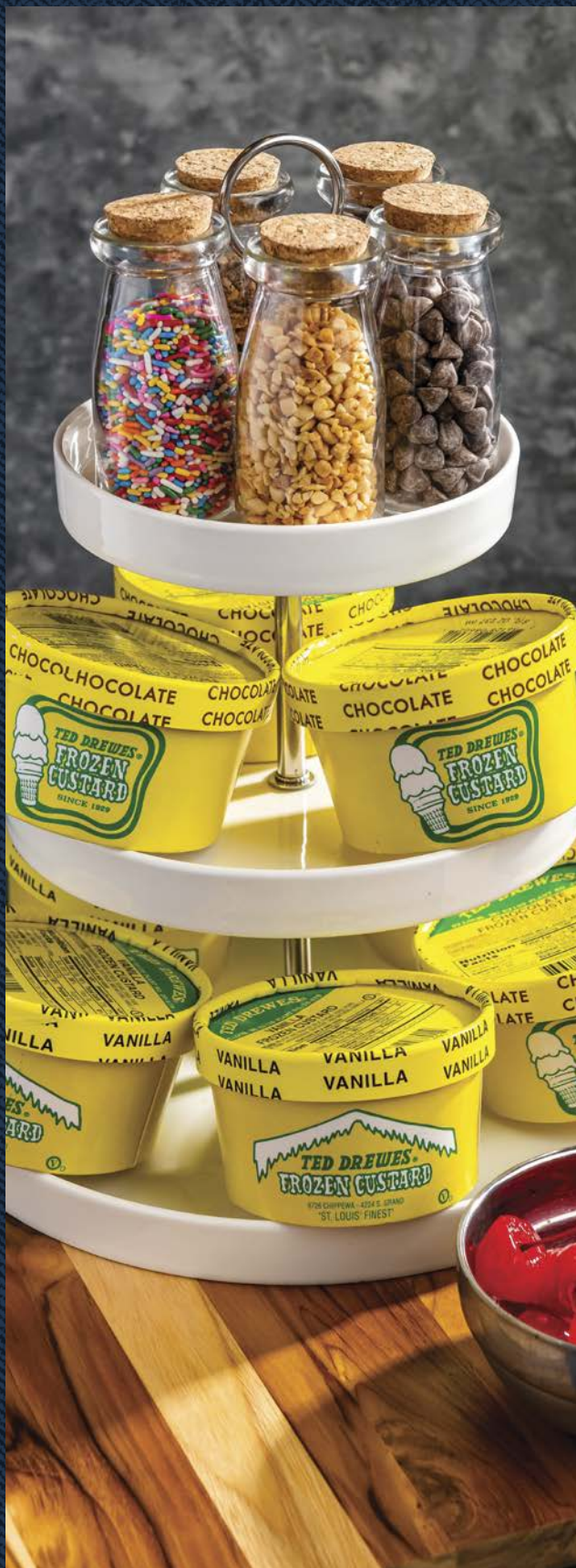
Ted Drewes + Enhance Your Custard