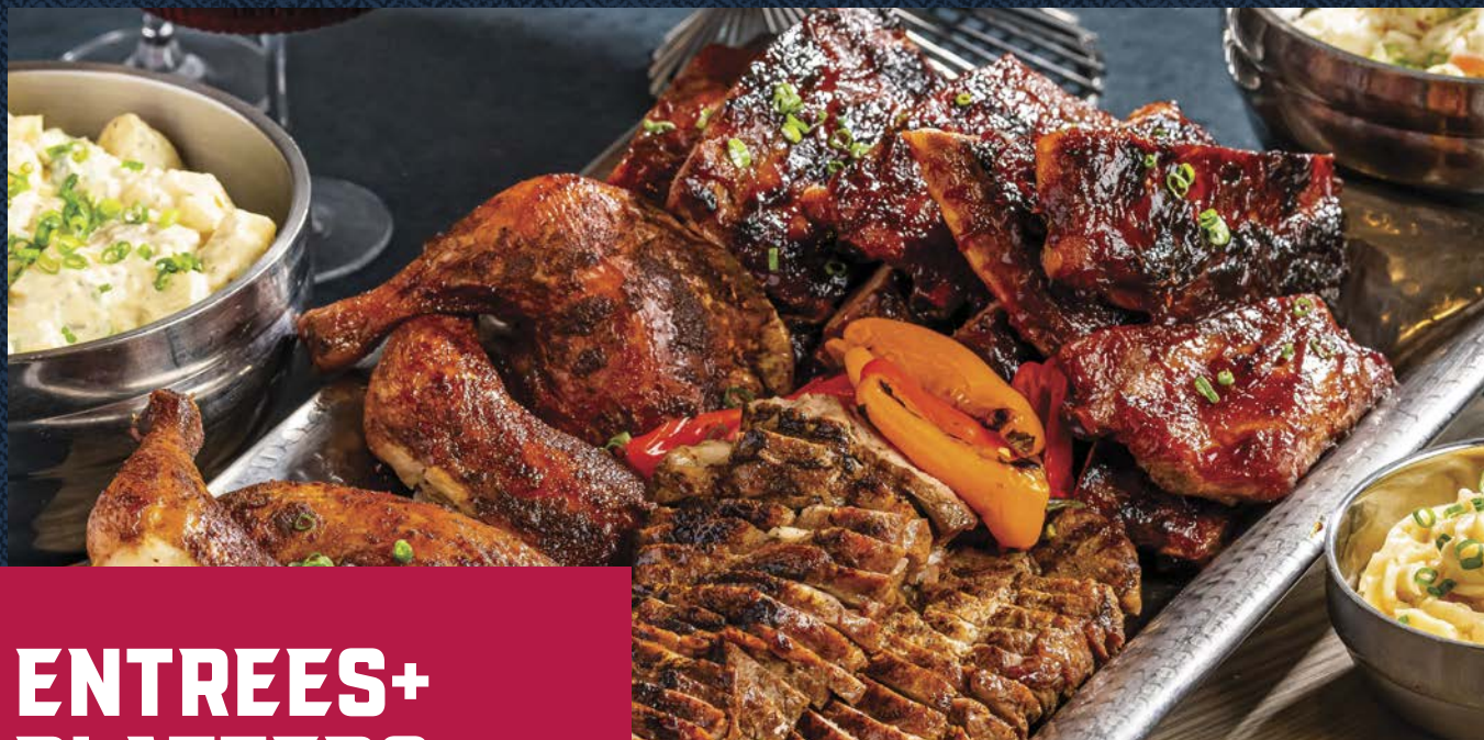
St. Louis BBQ Platter